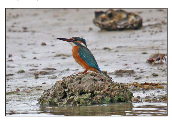
Kingfisher