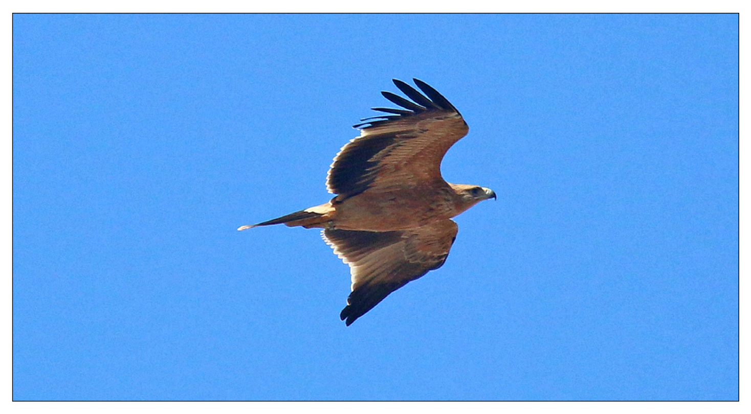
Spanish Imperial Eagle