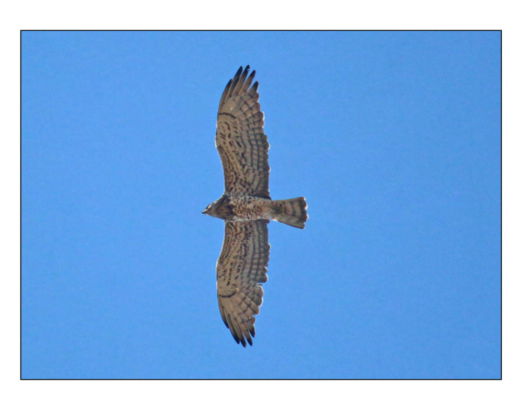
Short-toed Eagle