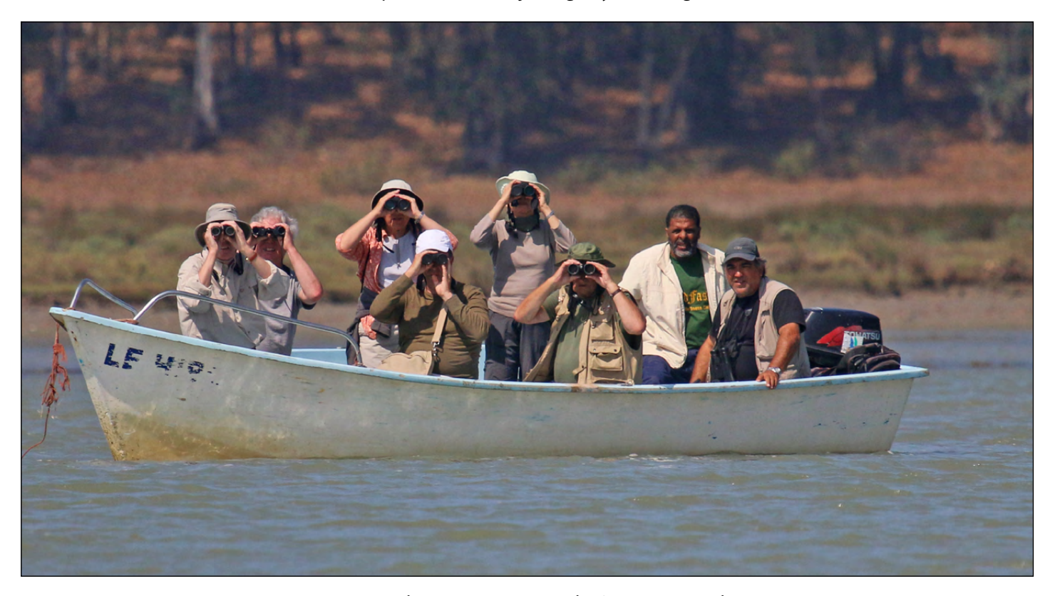
Group on boat at Merja Zerga