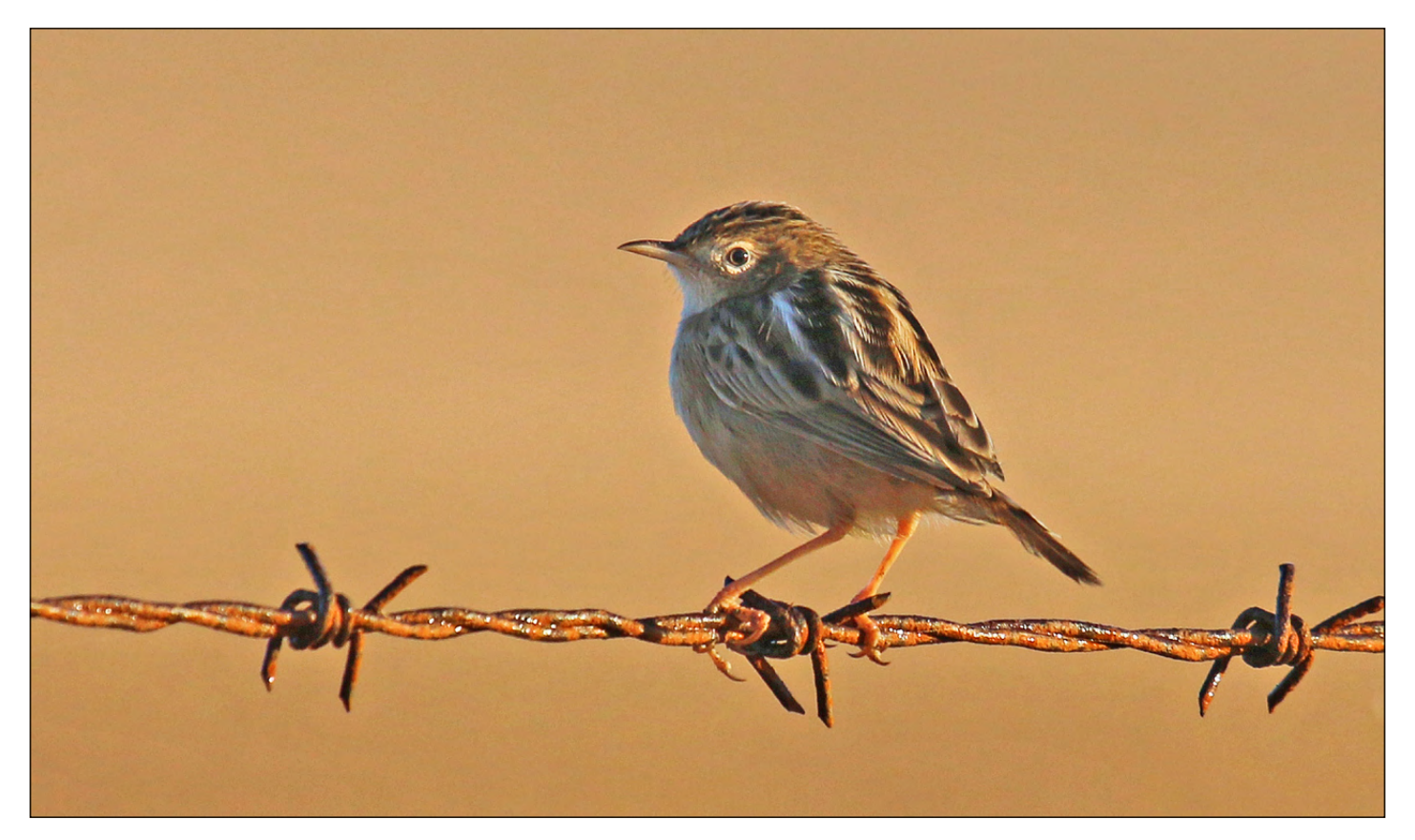
Zitting Cisticola

After a long day, it was great to get to bed for some well-deserved rest.