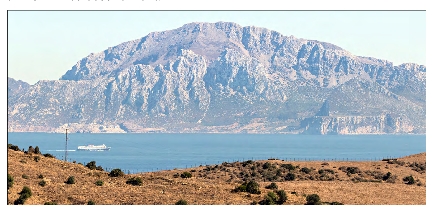
Africa from Spain across the Straits of Gibraltar by Tony Coombs

After docking, we headed up to a watch point in the hills where there was evidence of raptor migration with a nice party of BLACK STORKS and GRIFFON VULTURES which were circling around plus HONEY BUZZARDS, SPARROWHAWKS and BOOTED EAGLES.