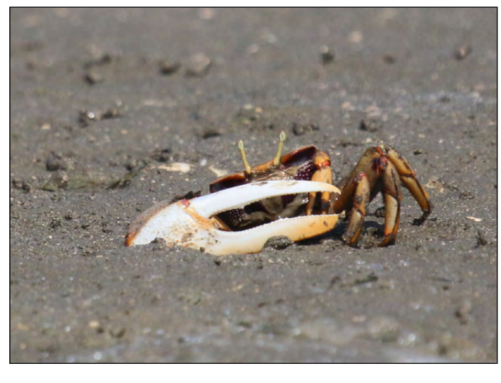
Fiddler Crab