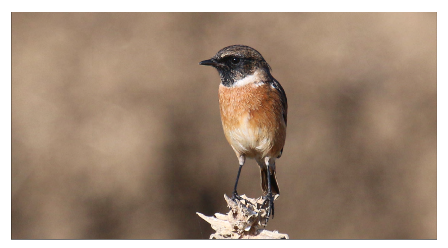
Stonechat