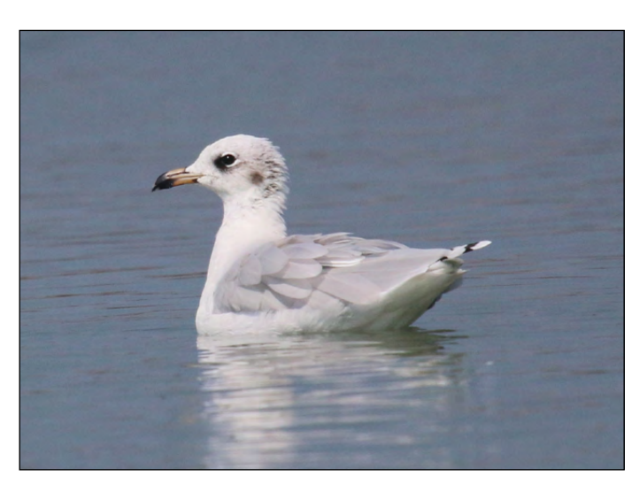
Mediterranean Gull