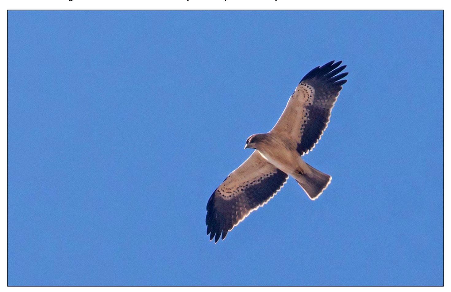
Pale-phase Booted Eagle

Our last evening meal of the tour was a lovely fish soup followed by swordfish and fruit salad to finish.