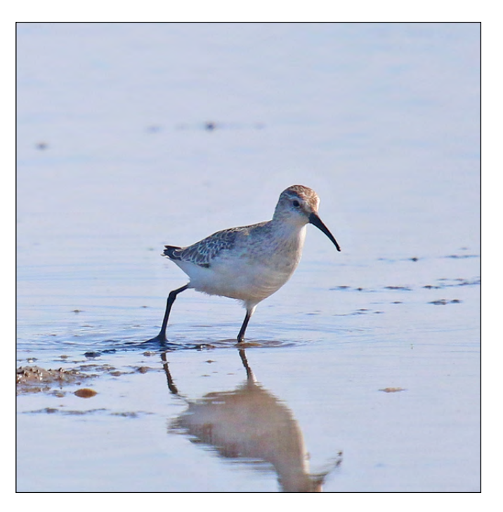
Curlew Sandpiper by Steve Grimwade

After a good few hours it was with reluctance that we had to turn back, but everyone had enjoyed a super morning and as we came into the small fishing area we spotted two COMMON BULBULS on the hillside.