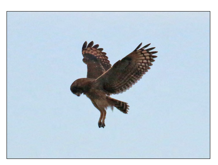
Marsh Owl