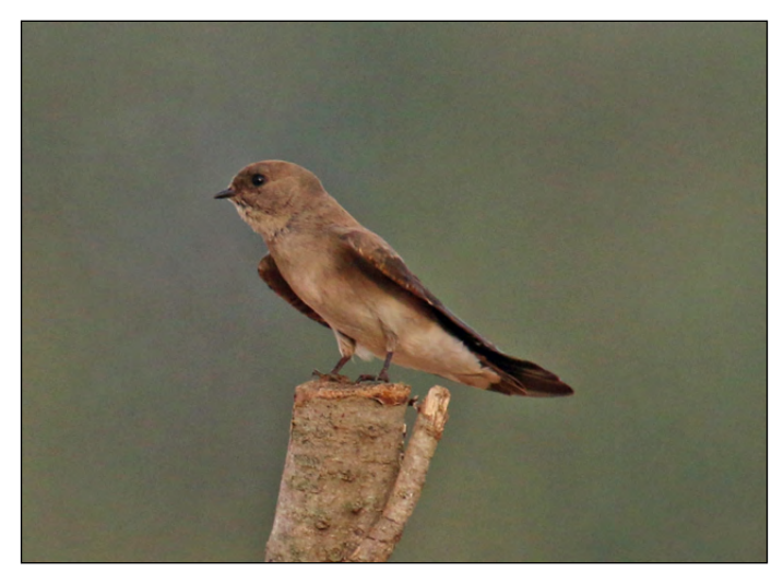
Brown-throated Martin