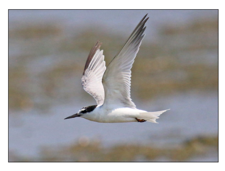
Little Tern