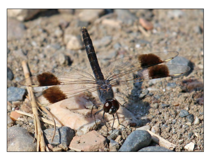
Banded Groundling