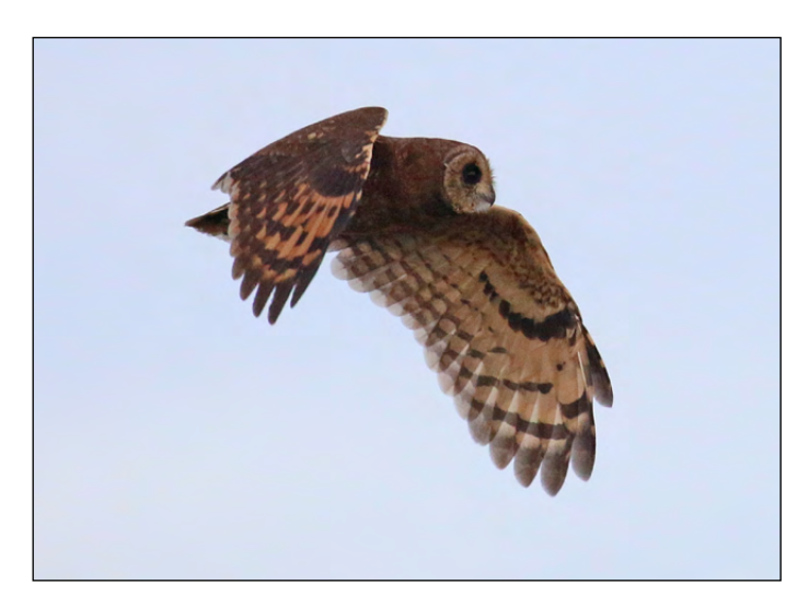
Marsh Owl