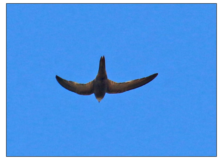
Pallid Swift