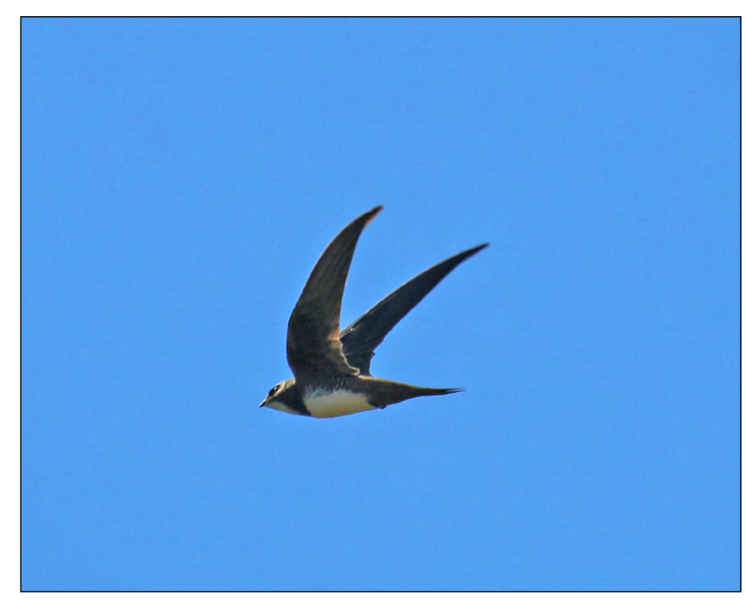
Alpine Swift by Steve Grimwade

The lovely warm weather meant that raptors were around hunting and during our time here we enjoyed good views of a GRIFFON VULTURE on the ground plus