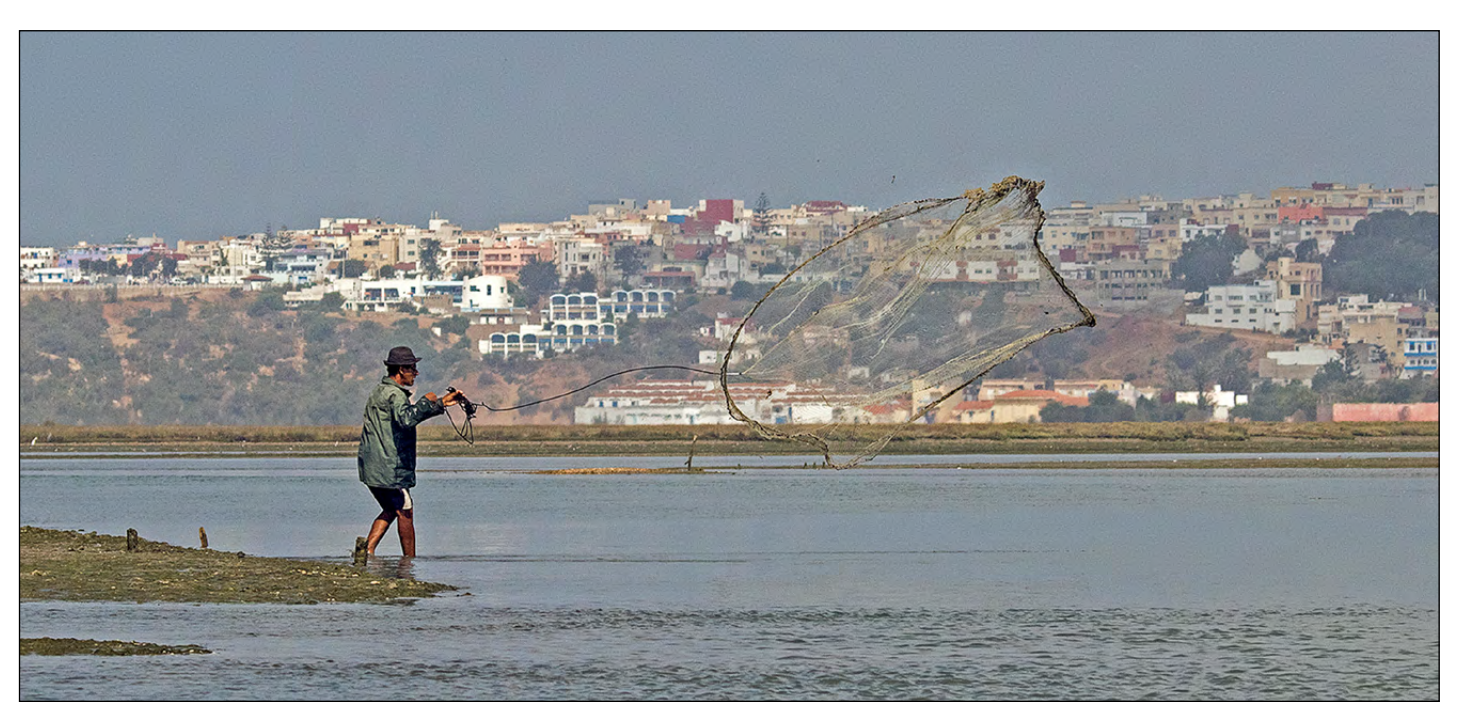
Fisherman at Merja Zerga