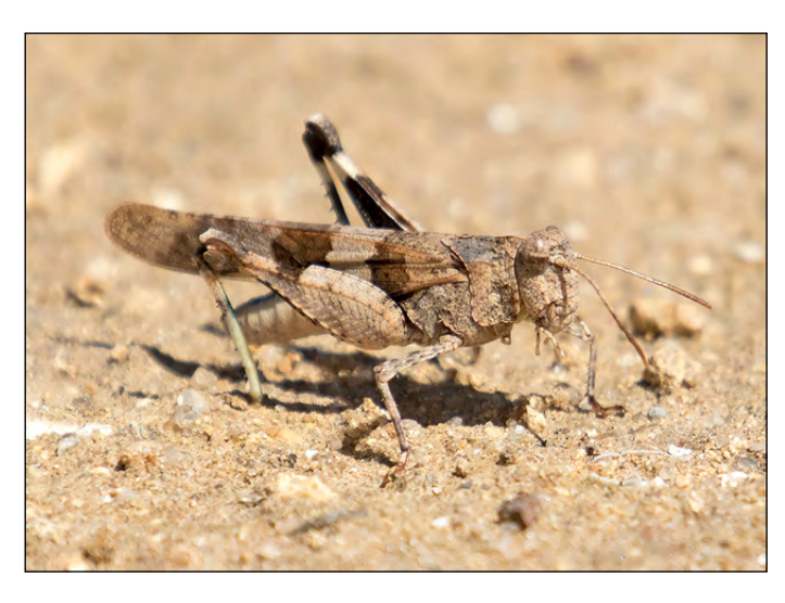
Blue-winged Grasshopper by Tony Coombs