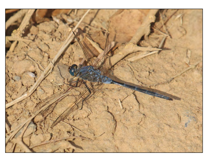
Male Long Skimmer