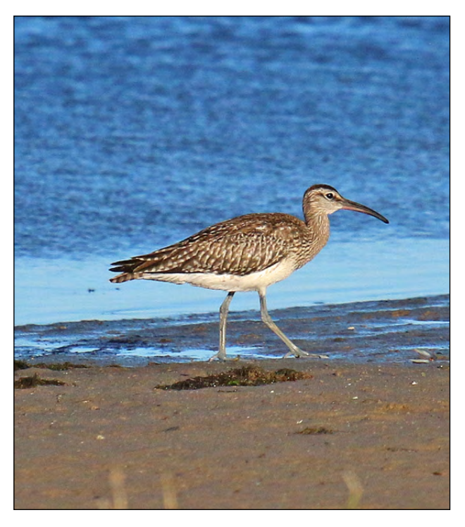
Whimbrel

We tried to find Red-necked Nightjar at a daytime roost but unfortunately, a warden turned up and moved us on.