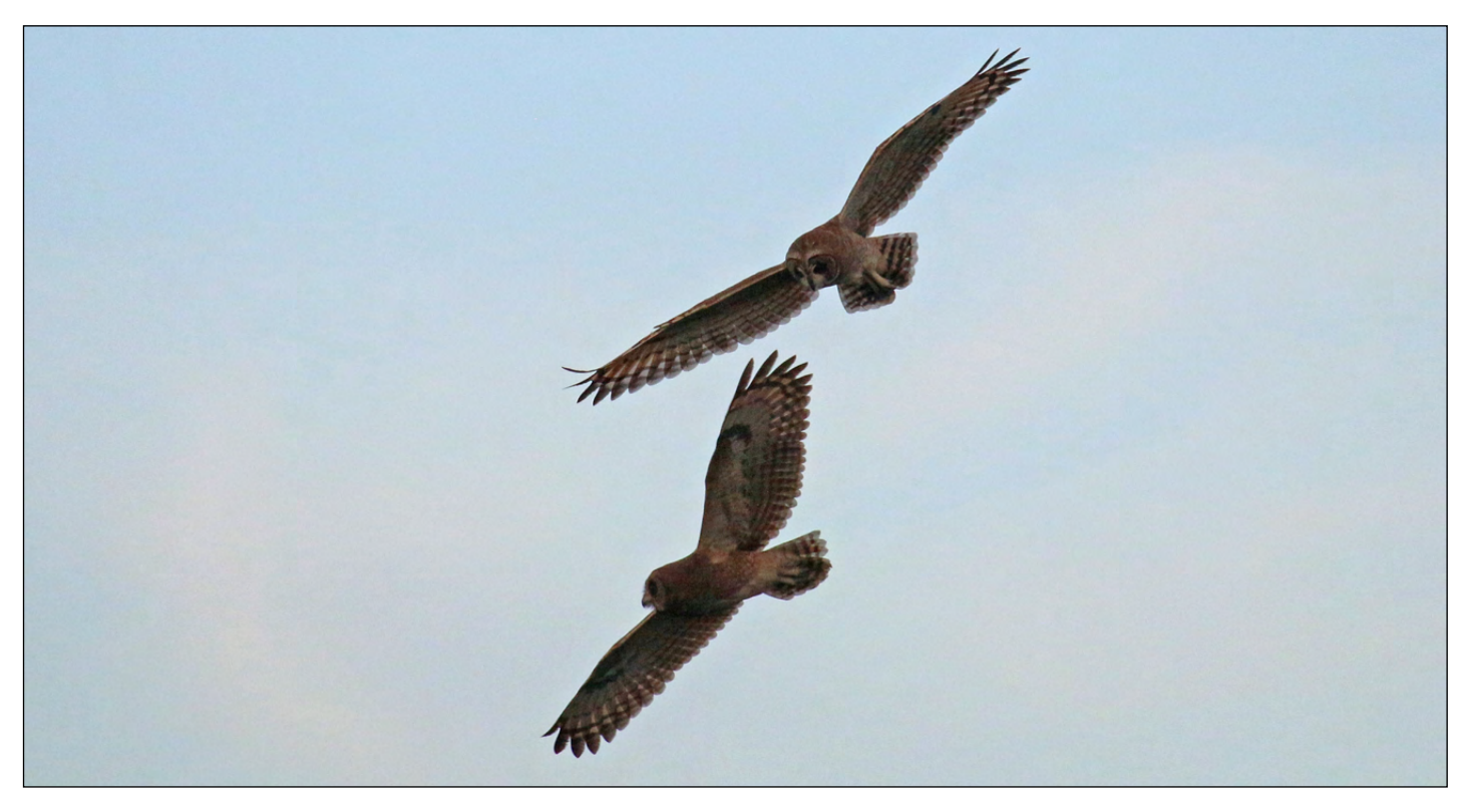
Marsh Owls