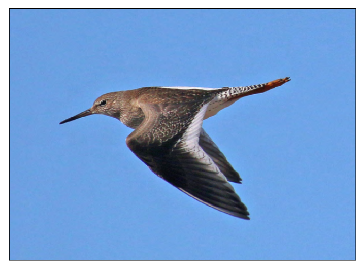
Redshank