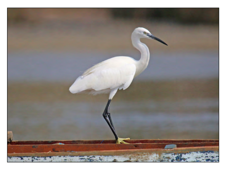
Little Egret