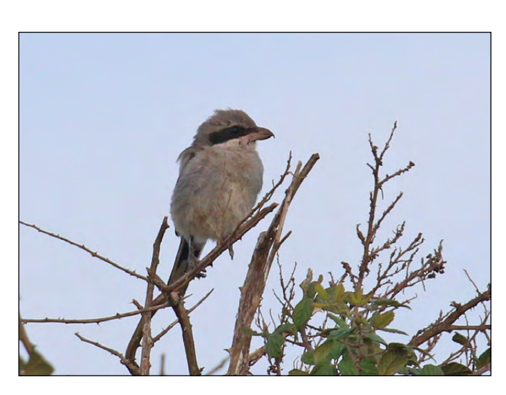
Great Grey Shrike by Steve Grimwade