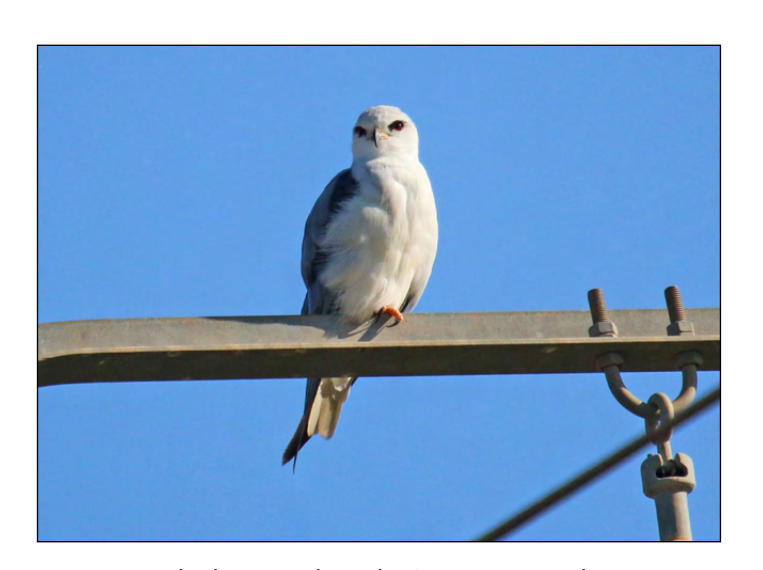
Black-winged Kite by Steve Grimwade