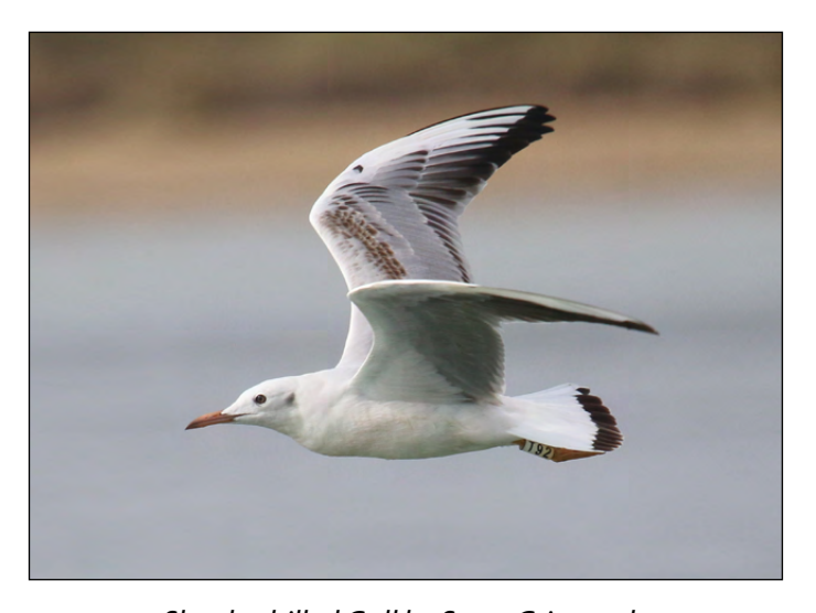
Slender-billed Gull by Steve Grimwade