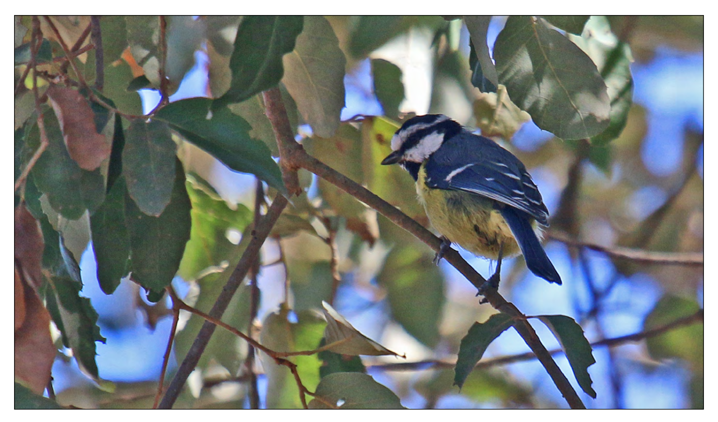
African Blue Tit

Turning onto a dirt track we drove a little way and then it was on foot down to the marshes. A few BLUE-HEADED WAGTAILS were seen with the sheep plus the ever present CATTLE EGRETS.