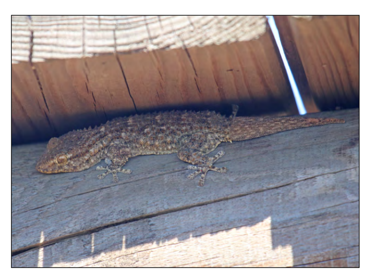
Moorish Gecko