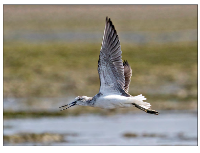
Greenshank