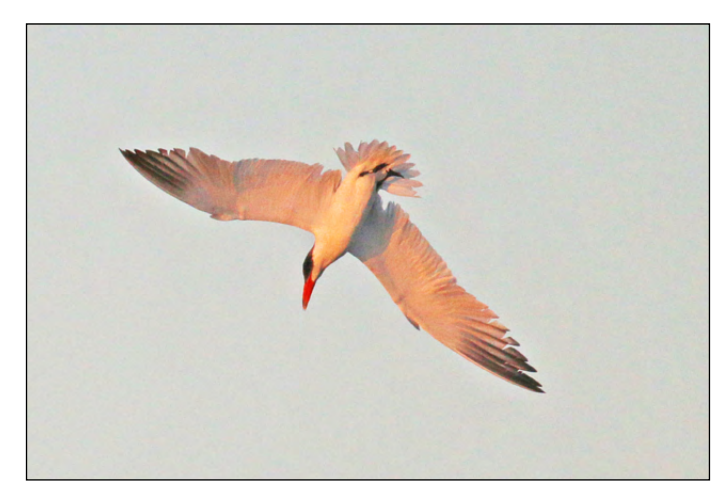
Caspian Tern by Steve Grimwade

With time running out we drove back and ventured out for our evening meal in the town, which was once again delicious and we headed off to bed after yet again another super day!