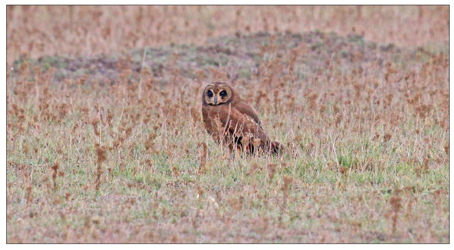
Marsh Owl