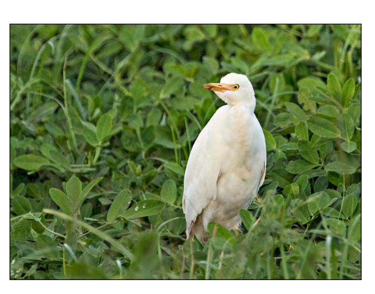
Cattle Egret