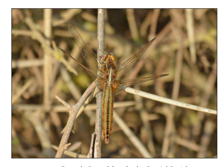
Female Broad Scarlet

Anax parthenope Anax imperator Crocothemis erythraea Sympetrum fonscolombii Brachythemis leucosticta Orthetrum trinacria