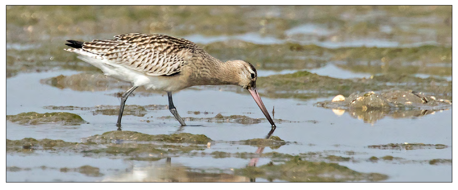
Bar-tailed Godwit by Tony Coombs

Camarinal Lighthouse - Cazalla Watchpoint - Rio de Guadalahorce - Malaga Airport - Ldn Gatwick