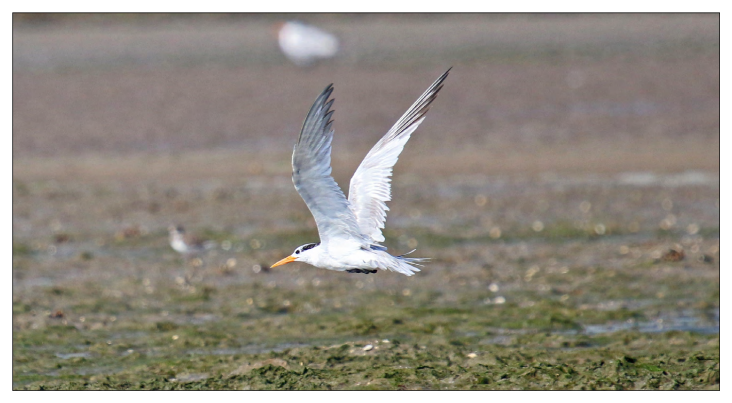
Lesser Crested Tern by Steve Grimwade