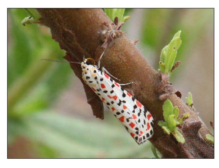
Crimson Speckled Moth