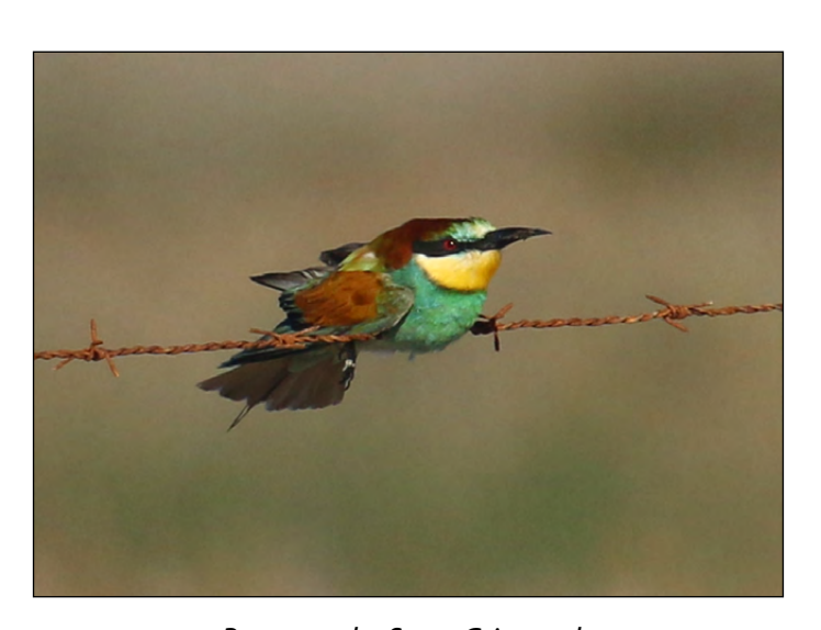
Bee-eater