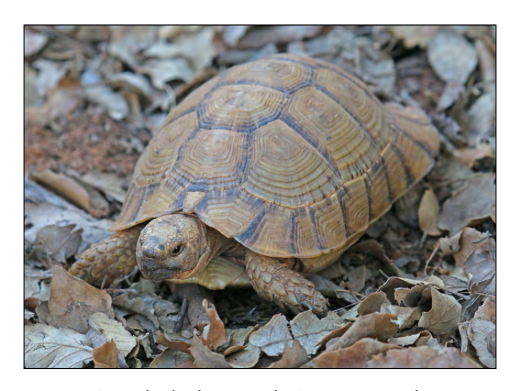
Spur-thighed Tortoise