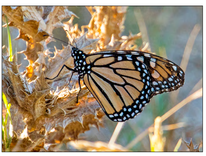
Monarch by Tony Coombs

Delphinus delphis Pipistrellus pipistrellus Tarentola mauritanica Testudo graeca Mauremys leprosa Utetheisa pulchella Macroglossum stellatarum Uca tangeri Oedipoda caerulescens Oedipoda germanica Scarabaeus sacer Xylocopa violacea