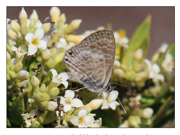
Long-tailed Blue

Danaus plexippus Lampides boeticus Vanessa atalanta Pieris brassicae