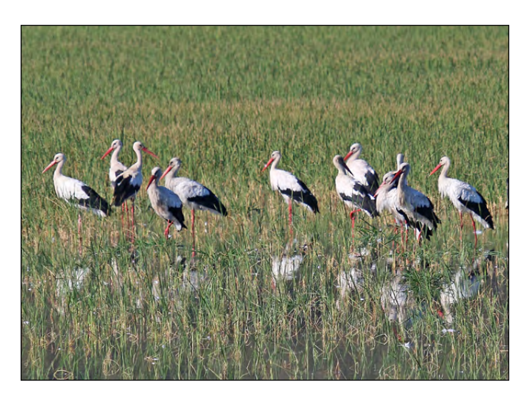
White Storks