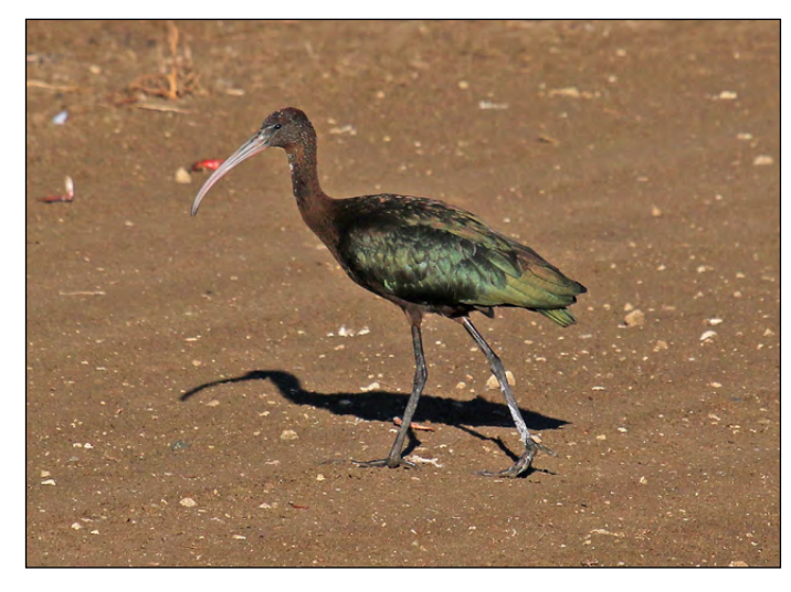
Glossy Ibis by Steve Grimwade

The morning was spent at La Janda which was alive with birds as soon as we left the main road. STONECHATS and ZITTING CISTICOLA'S were incredibly numerous along with HOUSE SPARROWS, SERINS and CORN BUNTINGS. As we drove along the track, a SPECTACLED WARBLER was seen flitting along the road and skulking in the bushes but remained quite elusive as it kept low down. WHITE STORKS stood around in fields and several TURTLE DOVES were noted.