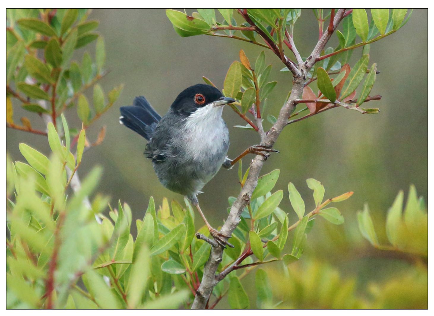
Sardinian Warbler by Peter Hobbs

We timed it to perfection with good numbers of BOOTED & SHORT-TOED EAGLES plus BLACK KITES, SPARROWHAWKS, HONEY BUZZARDS, nine BLACK STORKS and over 250 WHITE STORKS in one large flock.