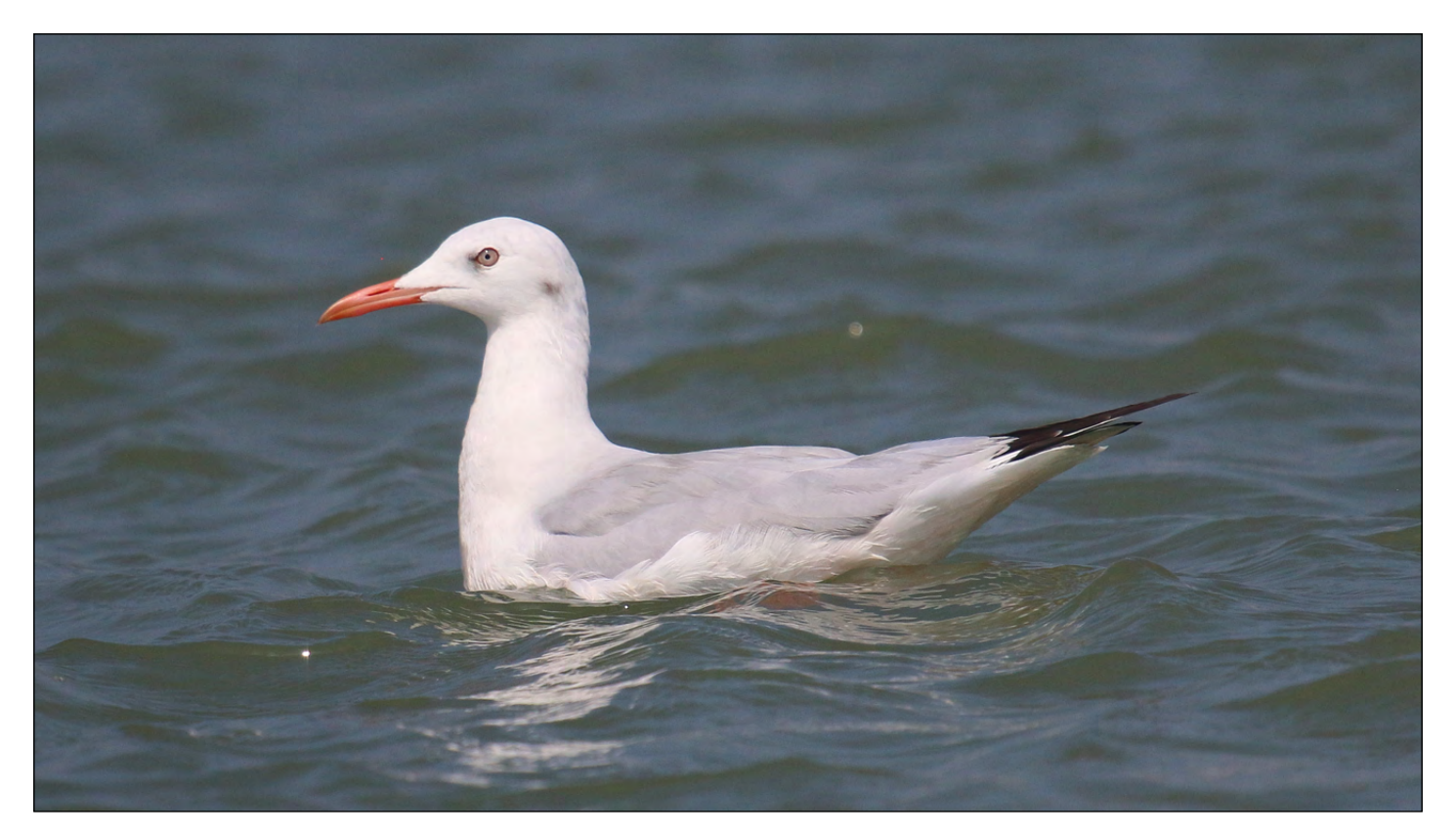
Slender-billed Gull by Steve Grimwade