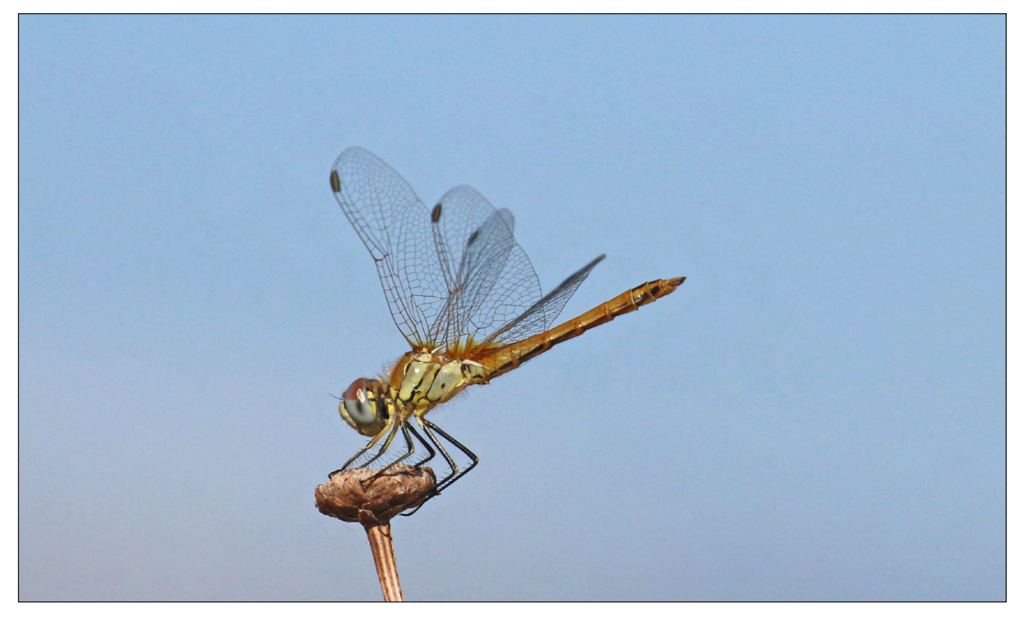
Female Red-veined Darter by Steve Grimwade

Scanning the skies reaped dividends when amongst the PALLID & COMMON SWIFTS, a WHITE-RUMPED SWIFT appeared briefly and two lucky members of the group got good views as it powered northwards. We all however, managed good views of a flock of ALPINE SWIFTS that wheeled around above our heads offering good photographic opportunities.