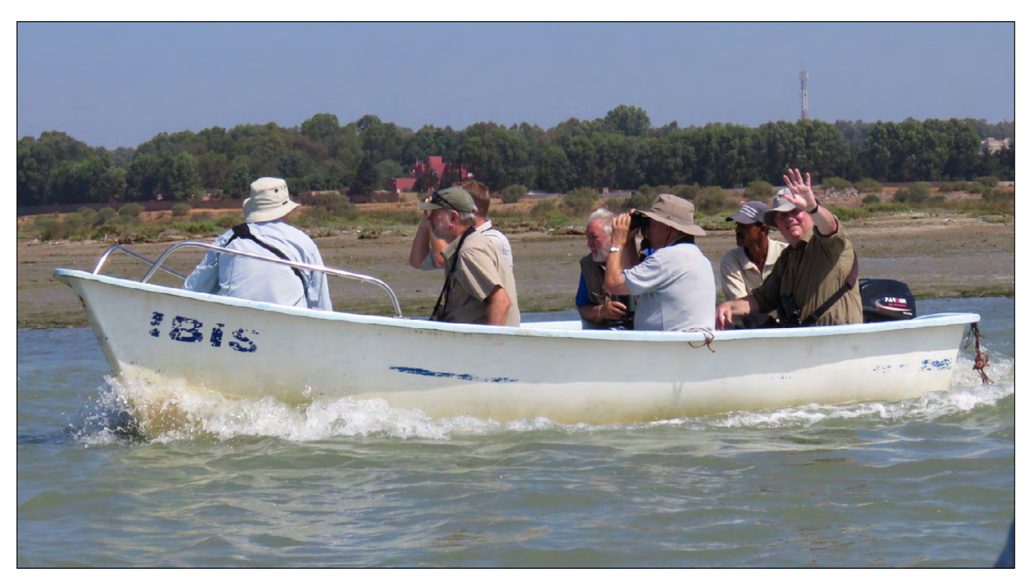
Group on boat at Merja Zerga