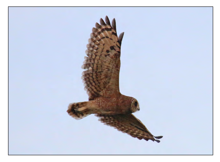
Marsh Owl