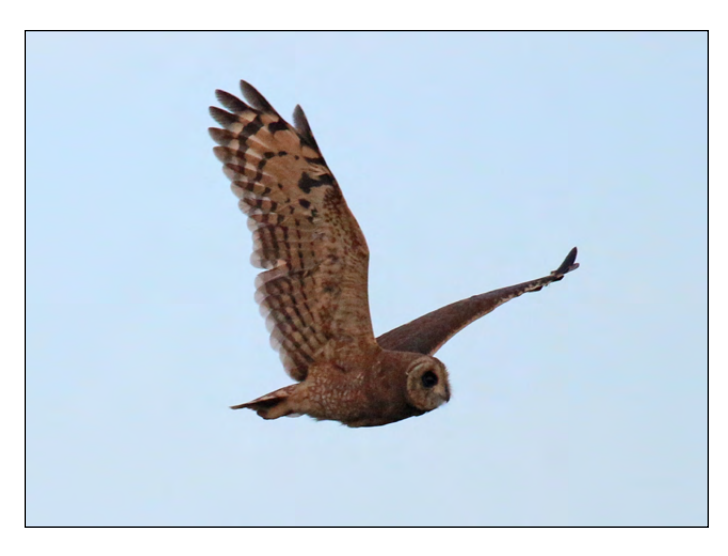
Marsh Owl